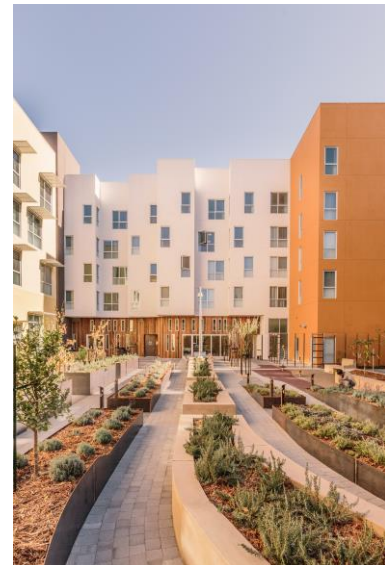
Bayview Hill Gardens, 72 units of housing for formerly chronically homeless individuals and families