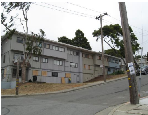
Hunters View Public Housing, pre-transformation work