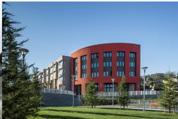
Hunters View Public Housing, post-transformation work

V. Creation of a Middle-Income Rental Program. Bond funds may be allocated to support the creation of permanently affordable rental units designated for middle-income households that are currently not served by the City’s traditional affordable housing programs. Bond funds used for the creation and support of middle-income rental units will prioritize family-sized units. Further, in order to facilitate a “housing ladder,” first time homebuyer programs (such as the Down Payment Assistance Loan Program) may target outreach efforts to households that occupy deed restricted middle-income rental units. The Middle Income Rental Program will target two categories of households: first, those earning between 80-120% AMI, which have a significant affordability gap at all unit sizes. Second, bond proceeds may be used to support larger families seeking 2BR-4BR units, which also have a demonstrated affordability gap in certain neighborhoods. For this latter category of funding, the 150% AMI affordable housing price must be at least 20% below the market-rate housing cost for eligibility.