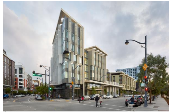
180 4 th Street, 150 family units