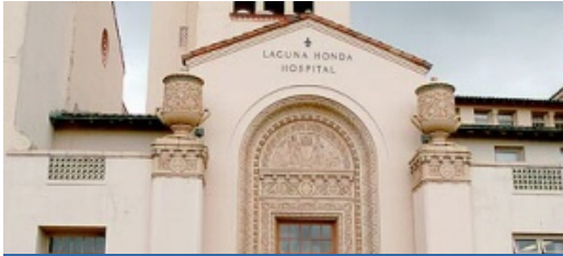
LHH Patient's Gift Fund